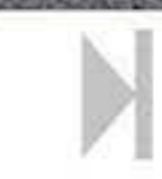
◀ Angle of View 39° Horizontal ( 50 mm Lens )